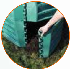
Compost can be removed from any side