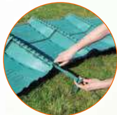
Easy assembly with no need for tools